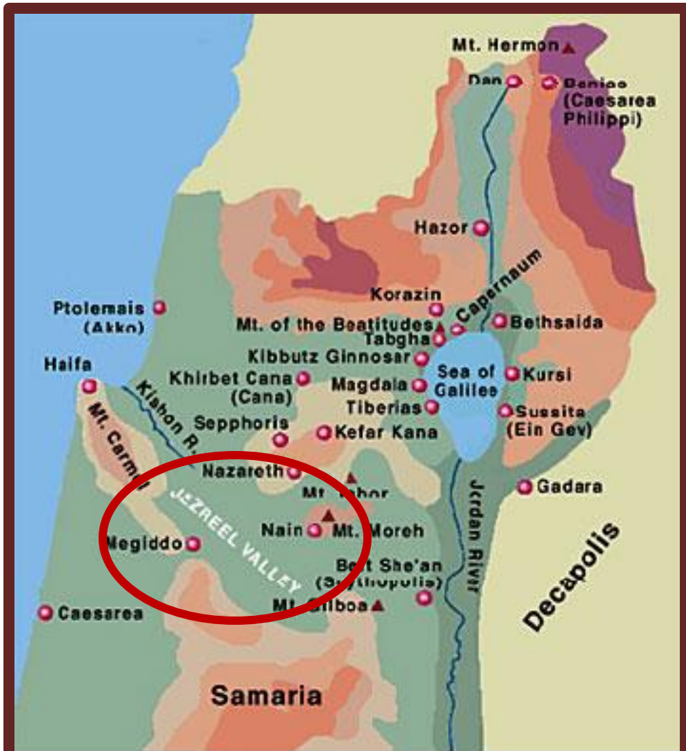
The Valley of Jezreel, also known as the Valley of Armageddon